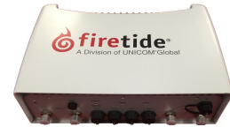
HotPort 7010(W) (HotPort 7010 Weatherized)