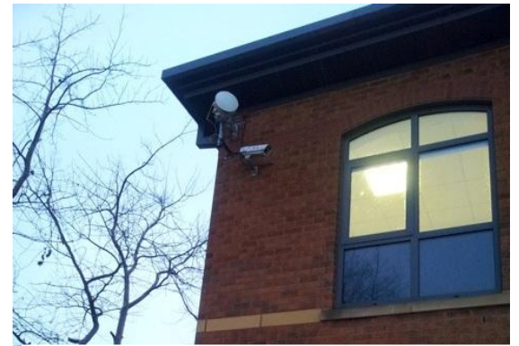
EtherHaul-1200 installation for video surveillance backhaul

These benefits are achieved by installing cameras in public spaces, video monitoring of cars, parking lot monitoring, license plate recognition, as well as many other applications. All the data collected through the cameras need to be securely transmitted to the monitoring centers in real-time. For this, an effective backhaul network needs to be built. Typical requirements of the backhaul equipment: