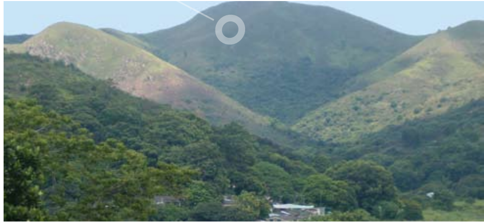
Cellular backhaul in village with no Line of Sight

“RADWIN’s WinLink 1000 enabled us to reduce the implementation time of our new network POPs and it significantly reduced our OPEX & CAPEX. We use RADWIN for cellular backhauling because it is a carrier-class solution.”