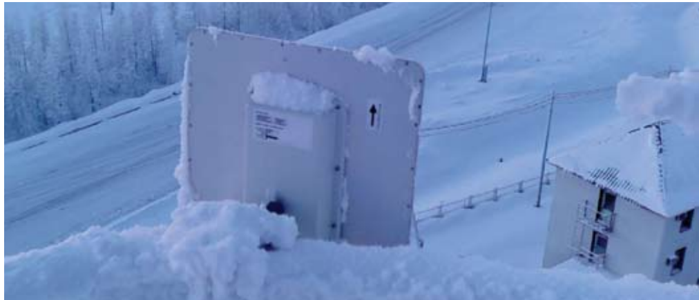
RADWIN's WinLink 1000 in Russia at -50 degrees celsius