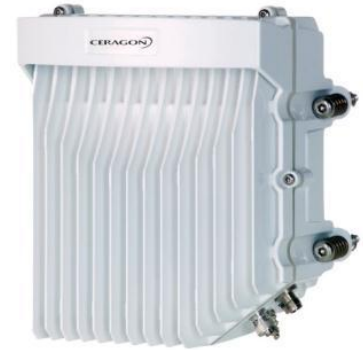
Figure 4 - Evolution Series Long Haul Radio Unit: ATEX Certified and marine-environment resistant

Differentiated services: Evolution Series radios are native Ethernet radios with a built-in QoS mechanism to handle prioritized traffic that supports differentiation of services as it guarantees bandwidth and appropriate latency for mission-critical services.