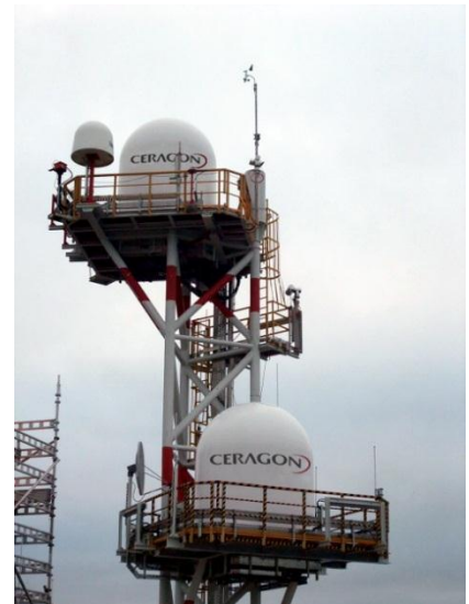
Figure 2 - PointLink System Installation