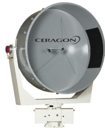
Figure 3 - Gyro Stabilized PointLink Antenna

On rotating platforms (e.g., FPSOs) the available antenna locations will normally not cover 360 degrees of unobstructed sight, so the system design must include multiple antennas. The PointLink system compensates for this problem as two or more antennas can be joined in a sector operation. Combined with hitless switch-over, PointLink ensures error-free 360 degrees operation year after year (A case study about the PointLink solution on a rotating vessel is available on Ceragon's website). PointLink systems are shipped with their own innovative GPS Gyro including a motion sensor for position, heading and motion detection making PointLink independent of any rate or angular sensors which are highly dependent on the environment.