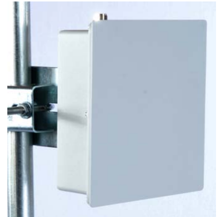
Standalone enclosure with cover plate